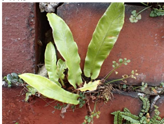
Wall Rue; Hart's-tongue Fern; Maidenhair Spleenwort (pictured left to right)

Have you noticed the tiny ferns growing on the red brick garden-wall next to the telegraph pole on Church Street at the entrance to St John's?